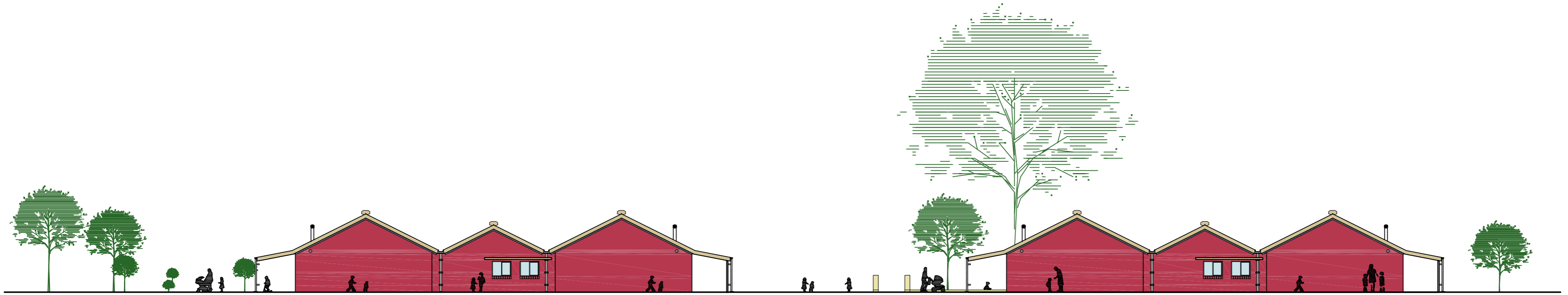
ELEVATION FROM THIRD AVENUE SCALE 1:200 @ A2