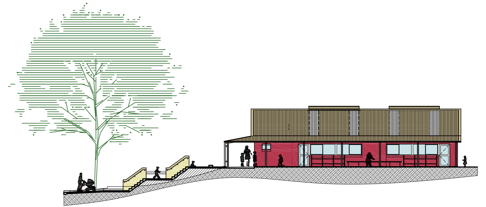
SECTION THROUGH THE STAIRS FACING NORTH SCALE 1:200 @ A2